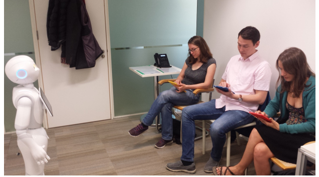
Figure 2: Experimental Setting. The observers sit at a distance of roughly 1.5 meters from the robot and fill out the questionnaires using a tablet.

Figure 2 shows the experimental setting: the observers filled out the questionnaires while sitting in front of the robot at a distance of roughly 1.5 meters. The questionnaires were filled out using a software interface running on a tablet. The 30 observers were selected randomly from a pool of subjects available at the research institute where the experiments were conducted. In terms of demographics, 20 observers were female and 10 were male; with the age distribution as depicted in Table 3. The participants were of varying ethnic and national origin. Only 3 observers had interacted with a robot before participating in the experiments of this work. The participants received a payment corresponding to the minimum legal hourly wage in the country where the experiments were conducted. The rest of this section presents the results of the analysis performed on the experimental results according to the approach presented in Section 3.