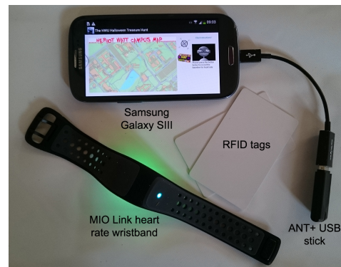
Figure 1: The THA Components

the purpose of this demonstration, a Samsung SIII phone and NFC technology [7] are used as shown in Figure 1.