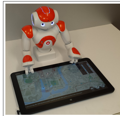
(b) Using a tablet computer