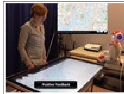
(a) Using a large touch table

empathic strategies, we are developing two scenarios that we intend to take into schools to perform long-term studies, a one to one tutoring scenario and a group learning scenario.