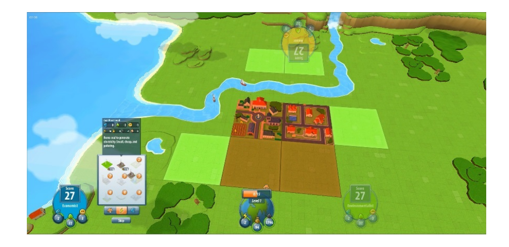
Fig. 1. Screenshot of Enercities game

Intelligent Energy Europe and this project reports that this serious game made students aware of energy expenditure, among others [16]. Schools across Europe have already used Enercities in their curriculum and this game was therefore chosen as the basis of our collaborative scenario. Within the EMOTE project, the original online single player game was adapted to a multiplayer version where participants interact by using a multi-touch table or a tablet. This was done to stimulate collaborative learning [17], [4].