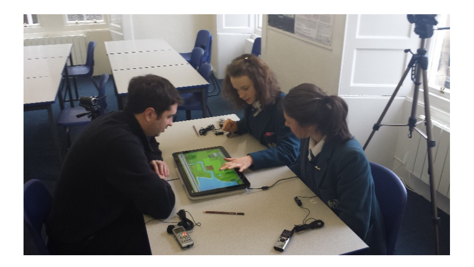
Fig. 4. Teacher playing Enercities with 2 students