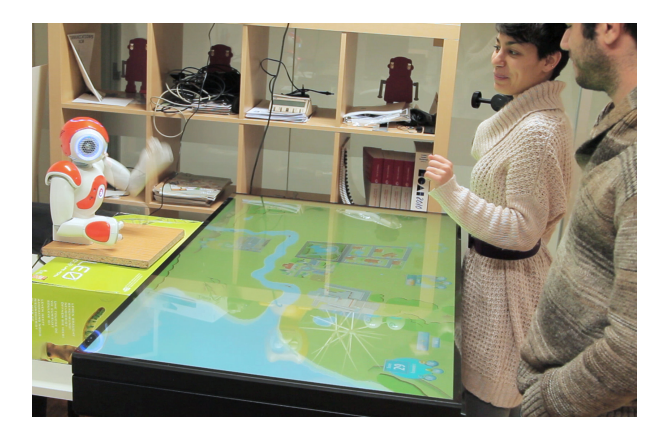
Fig. 2. Robotic tutor playing Enercities with students