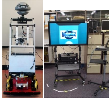
Fig. 1. Robotic (a) and virtual (b) embodiment of the agent

The two embodiments of the companion called Sarah used for this study had the same capabilities and appearance. Each had a non-naturalistic head, modelled on that of a turtle, used a unit-selection text-to-speech system with a Scottish English female voice, and carried out body tracking of the user using a Kinect sensor installed on the embodiment. A user interface was developed to allow a wizard to remotely control speech acts and direct the gaze of the agent head to indicate different locations in the room. The r-agent consisted of a Pioneer 3-MX robot with an enhanced superstructure and head, equipped with a laptop PC and Kinect sensor, as in Figure 1a. The graphical v-agent consisted of an animated 3d model of the same robot head displayed on a 42 inch LCD screen. A Kinect is installed underneath the screen as shown in Figure 1b.