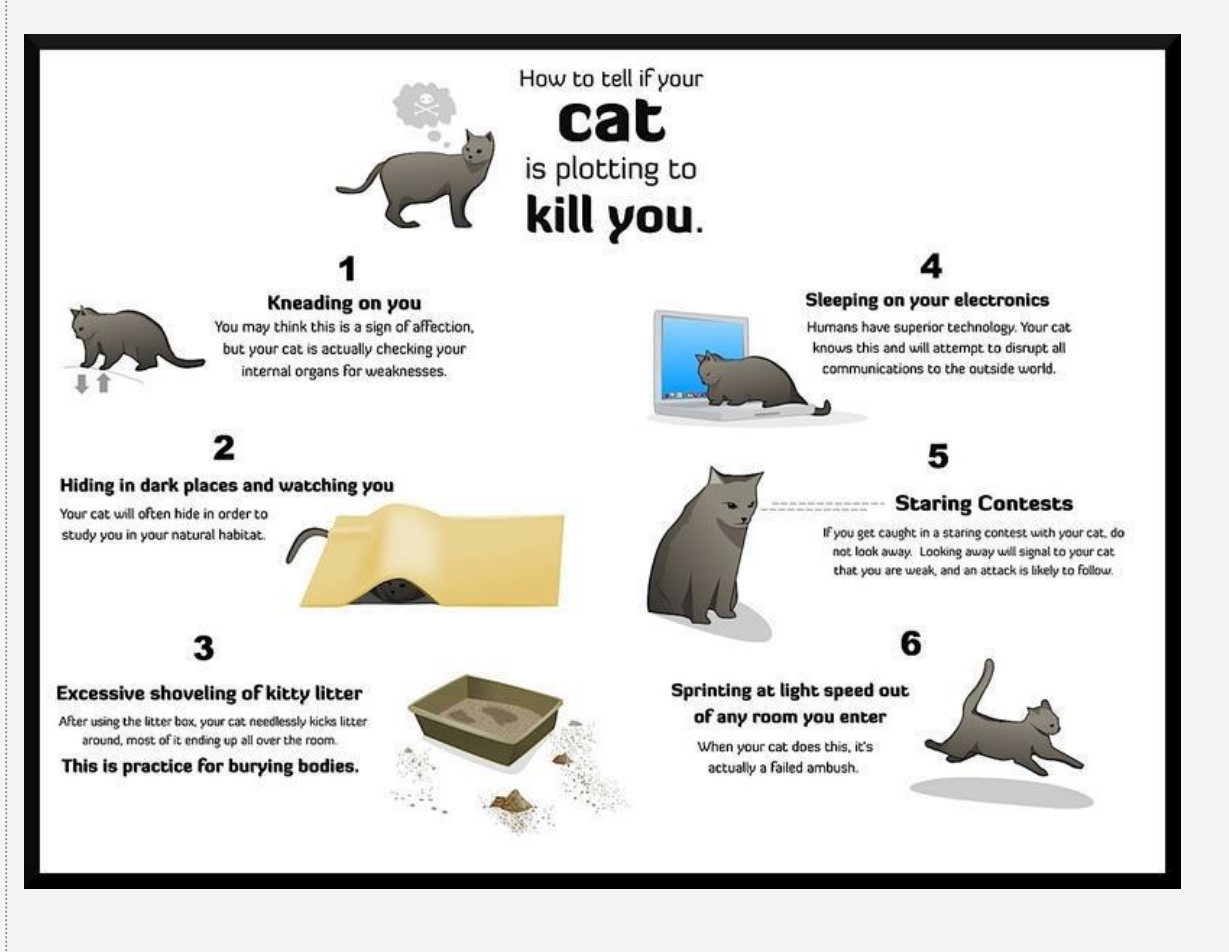
• also poop scooping.